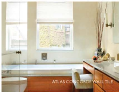
ATLAS CONCORDE WALL TILE