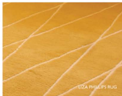
LIZA PHILLIPS RUG

Fiber-Optic lighting, long in commercial use, is now popular in homes for its energy efficiency, lack of generated heat, resistance to moisture, safety from shock, and ability to filter out ultraviolet rays, making it perfect for artwork. Affordable. CONTACT: Fibestars, (800) 327-7877; or MSK Illuminations, (212) 888-6474 ■