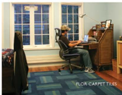
FLOR CARPET TILES