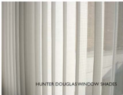
HUNTER DOUGLAS WINDOW SHADES