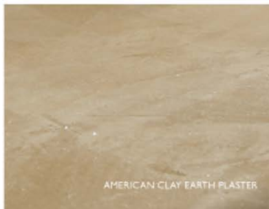
AMERICAN CLAY EARTH PLASTER